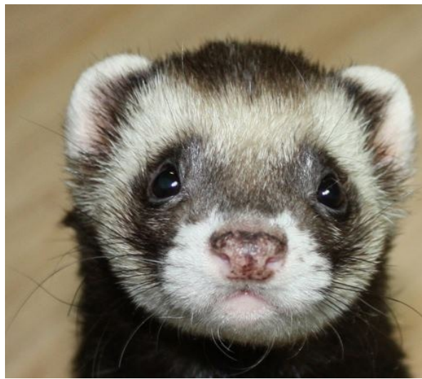
R.I.P. Geronimo 01/26/2012

Some of you may already know that my beloved ferret, Geronimo, died recently. He had mega-esophagus and breathed in food and water, which gave him pneumonia. The condition was most likely due to lymphoma of the gastrointestinal tract, but that wasn't confirmed.