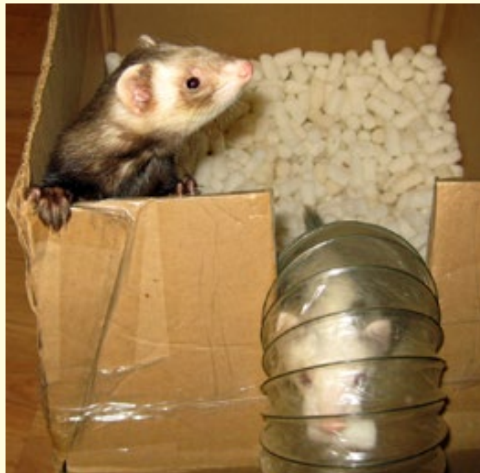
Roscoe and Brutus (in tube stealing peanut)