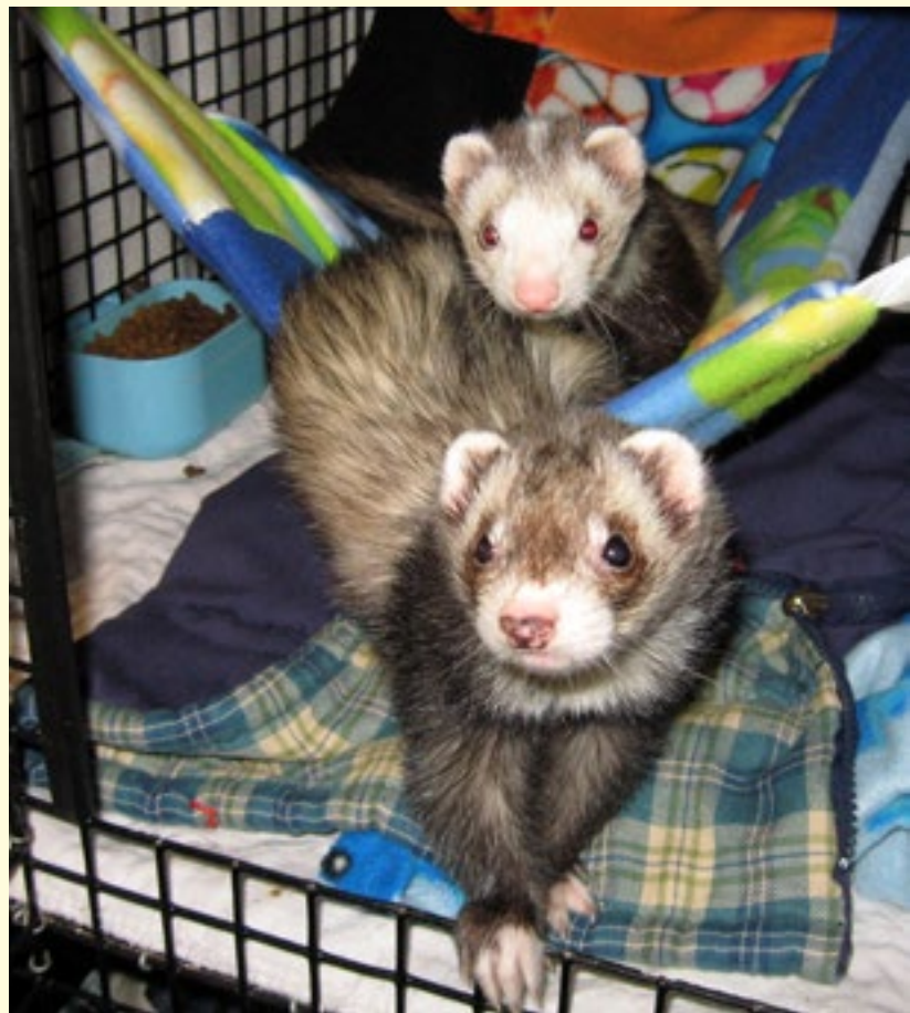
Bart and Calypso (available)