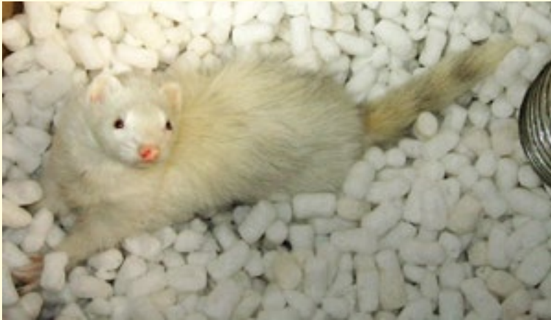
Sneaky Pete (available)